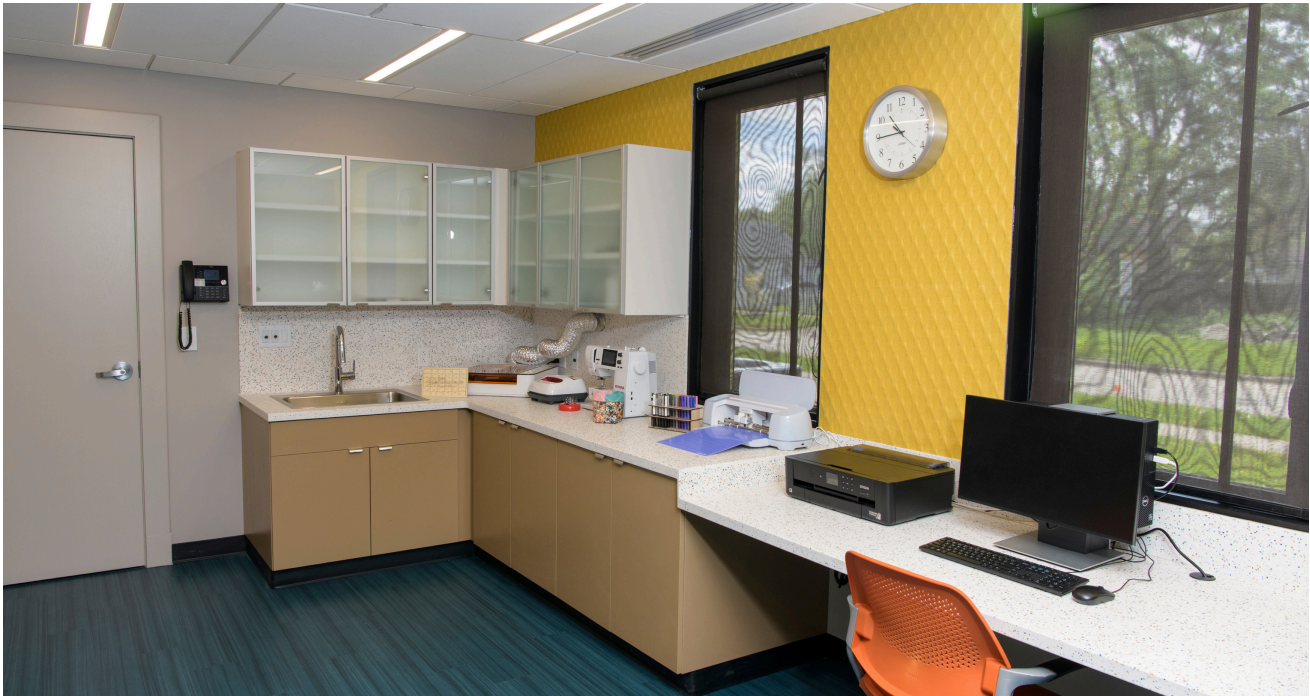
Table Talk Book Club Yields Meaningful Discussions

On March 10, 9 book club members were in attendance and discussed the book King of Ashes by S.A. Cosby.